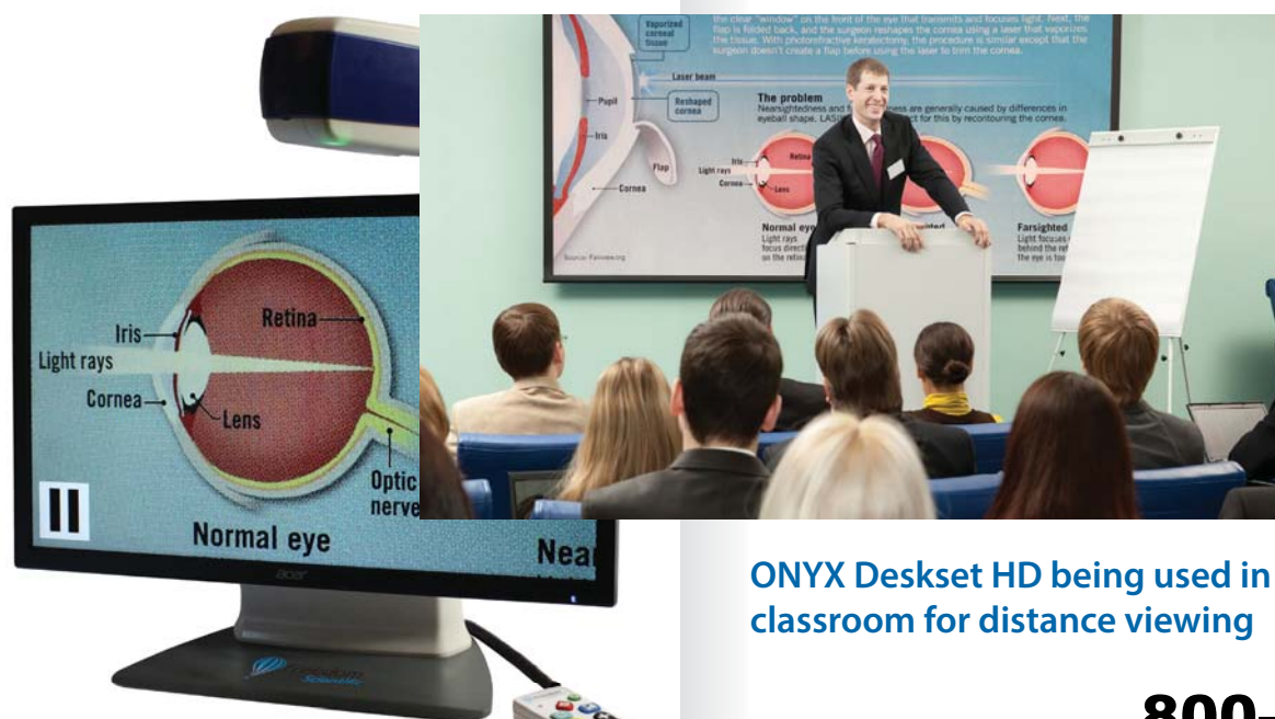
ONYX Deskset HD being used in classroom for distance viewing

zoom level but self-viewing to a small amount of magnification. The ONYX Deskset HD remembers each setting and automatically switches to your preferred settings when you aim the camera.