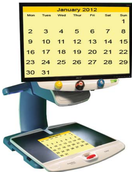
Get more on the screen - in crisp, clear high definition