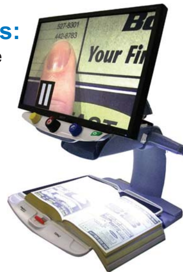
Use Freeze Frame to fix a still image on the screen and free up both hands

Widescreen 20-inch, 22-inch, and 24-inch LCD models – plus camera only and 17-inch LCD models